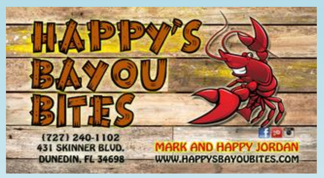
Wed/Thurs 11-4; Fri/Sat 11-6, Music both days and Happy Hour 3-6