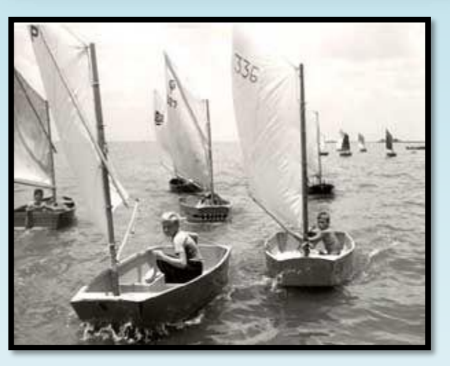
Area children race prams as part of its youth sailing club in this 1950s photo.