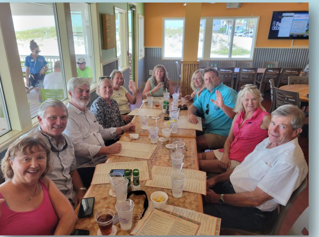
Some took the ferry to our Beach Rally