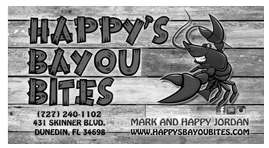
Wed/Thurs 11-4; Fri/Sat 11-6, Music both days and Happy Hour 3-6