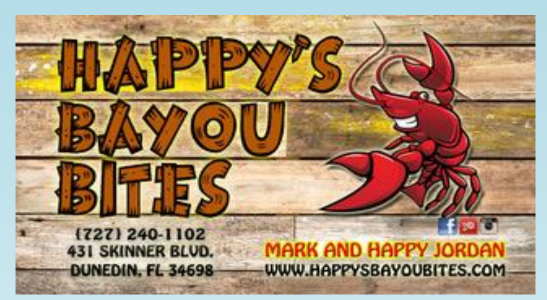
Wed/Thurs 11-4; Fri/Sat 11-6, Music both days and Happy Hour 3-6

727.215.4908 tampacoastlinedive@gmail.com