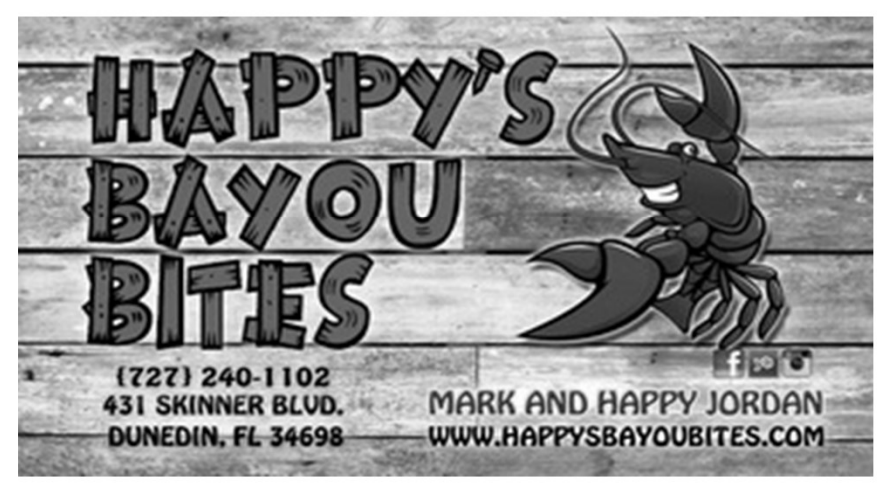
Wed/Thurs 11-4; Fri/Sat 11-6, Music both days and Happy Hour 3-6

727.215.4908 tampacoastlinedive@gmail.com