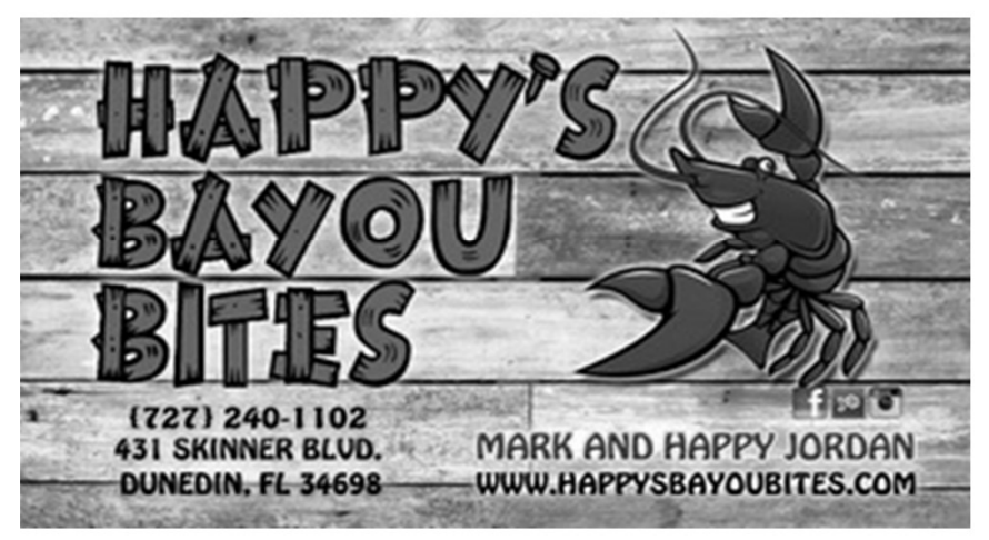
Wed/Thurs 11-4; Fri/Sat 11-6, Music both days and Happy Hour 3-6

727.215.4908 tampacoastlinedive@gmail.com