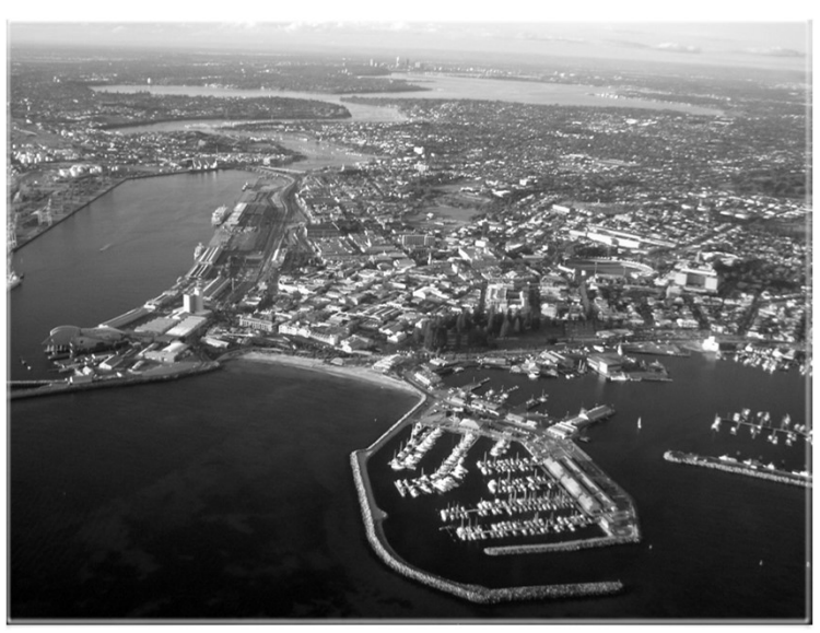
Aerial Photo of Fremantle & Swan River