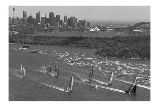
Sydney to Hobart Start