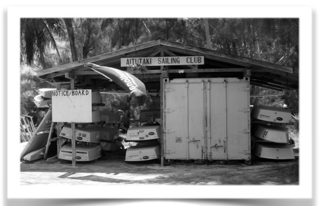
Aitutaki Sailing Club, Cook Islands