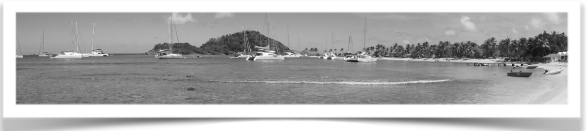
Sailing, Mayreau, The Grenadines