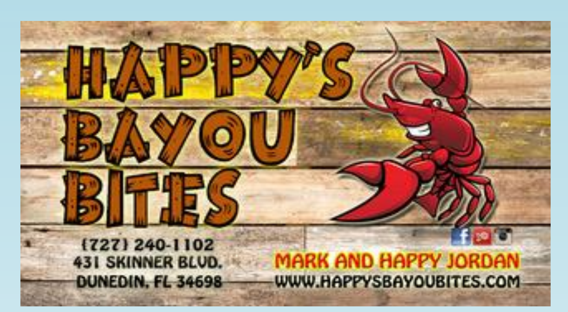
Wed/Thurs 11-4; Fri/Sat 11-6, Music both days and Happy Hour 3-6

727.215.4908 tampacoastlinedive@gmail.com