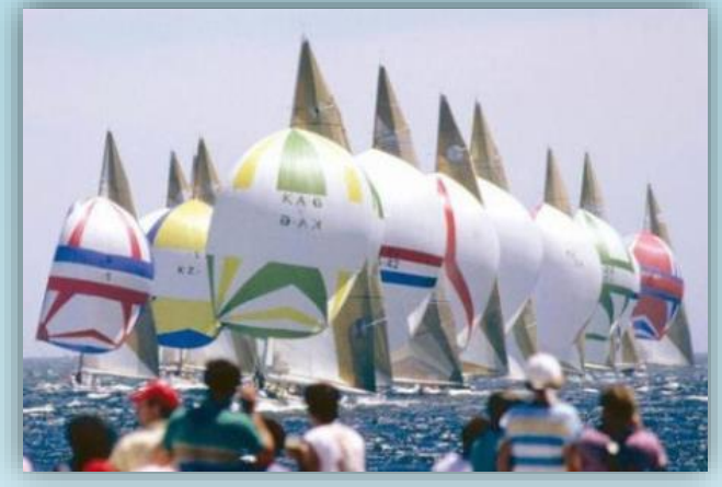
America's Cup Fleet in Fremantle

She explored sailing elsewhere in Australia, particularly breathtaking Sydney Harbor and participated in the lead-up to the famous Sydney to Hobart Race, one memorable time as a guest on the magnificent VO60 Nokia , one of the fastest ocean-racing yachts in the world.