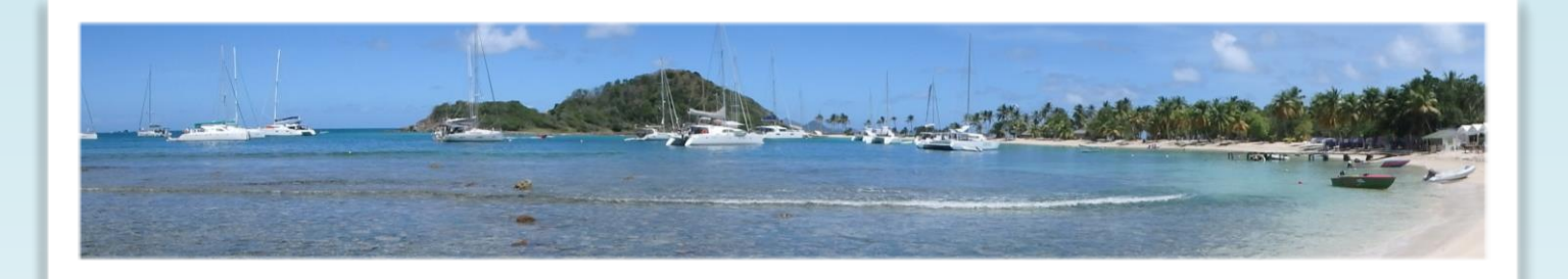
Sailing, Mayreau, The Grenadines