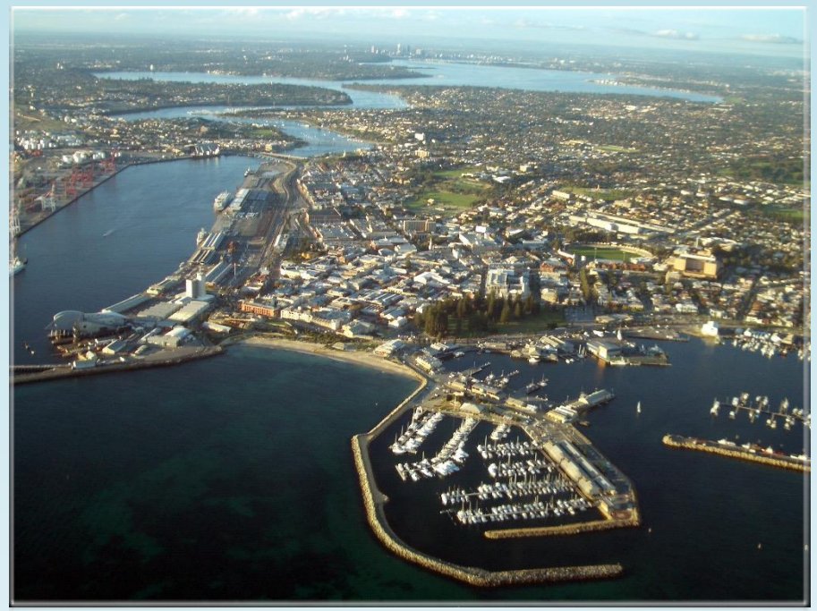
Aerial Photo of Fremantle & Swan River