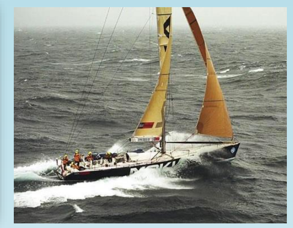
VO60 Nokia Michelle cruised Sydney Harbor on her... a memorable experience!