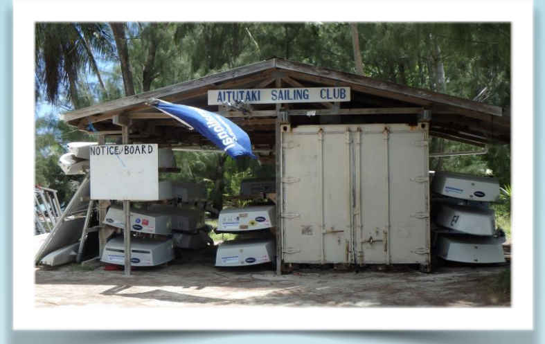
Aitutaki Sailing Club, Cook Islands