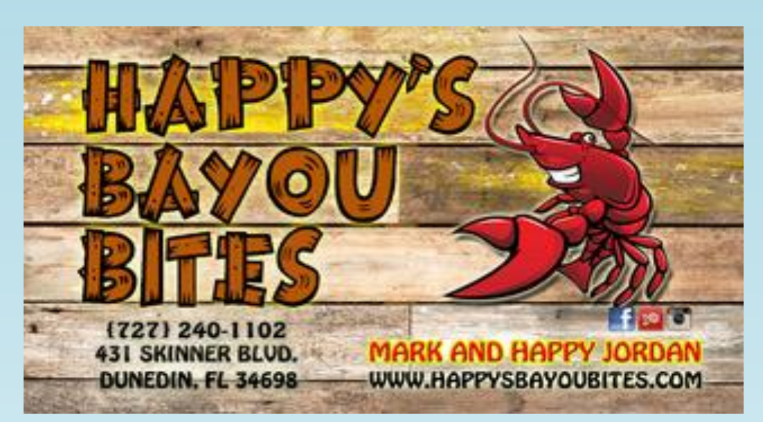
Wed/Thurs 11-4; Fri/Sat 11-6, Music both days and Happy Hour 3-6

727.215.4908 tampacoastlinedive@gmail.com