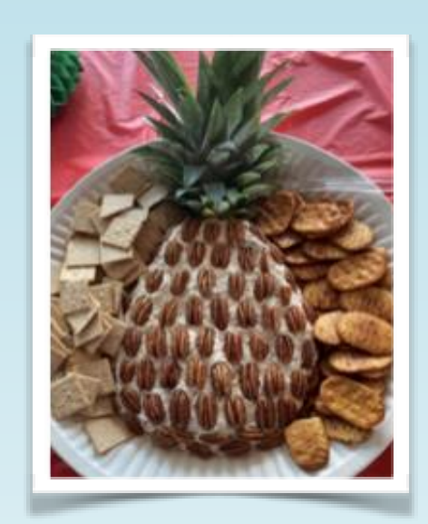
Special treat for Augusts Ship Store Sale. Pineapple Cheese Ball. Yummy!