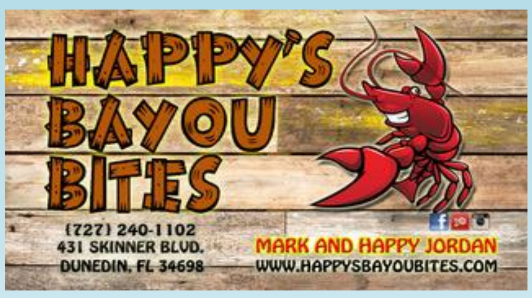
Wed/Thurs 11-4; Fri/Sat 11-6, Music both days and Happy Hour 3-6