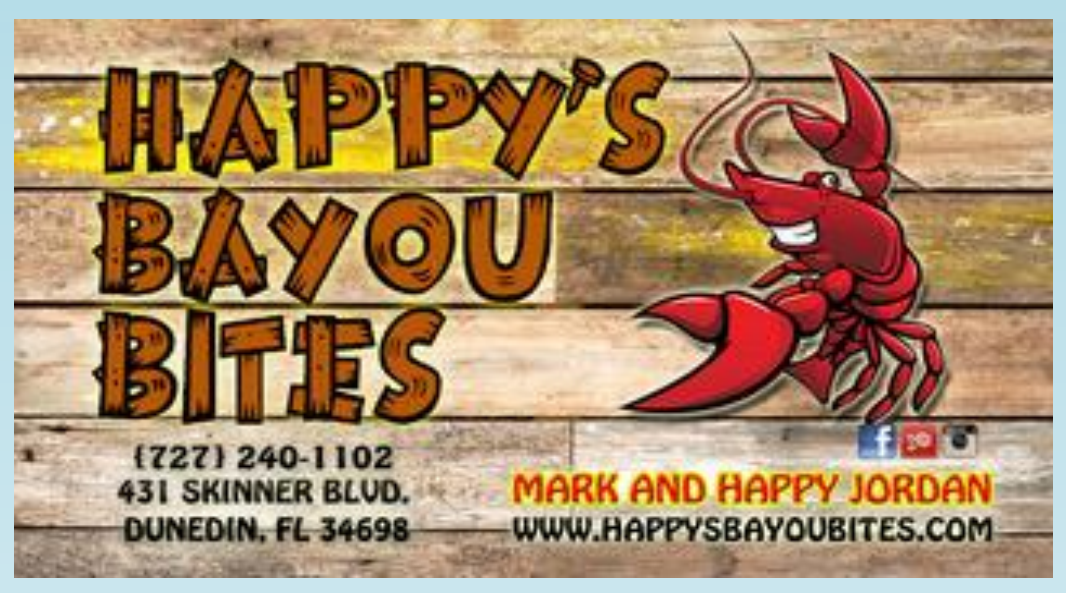
Wed/Thurs 11-4; Fri/Sat 11-6, Music both days and Happy Hour 3-6