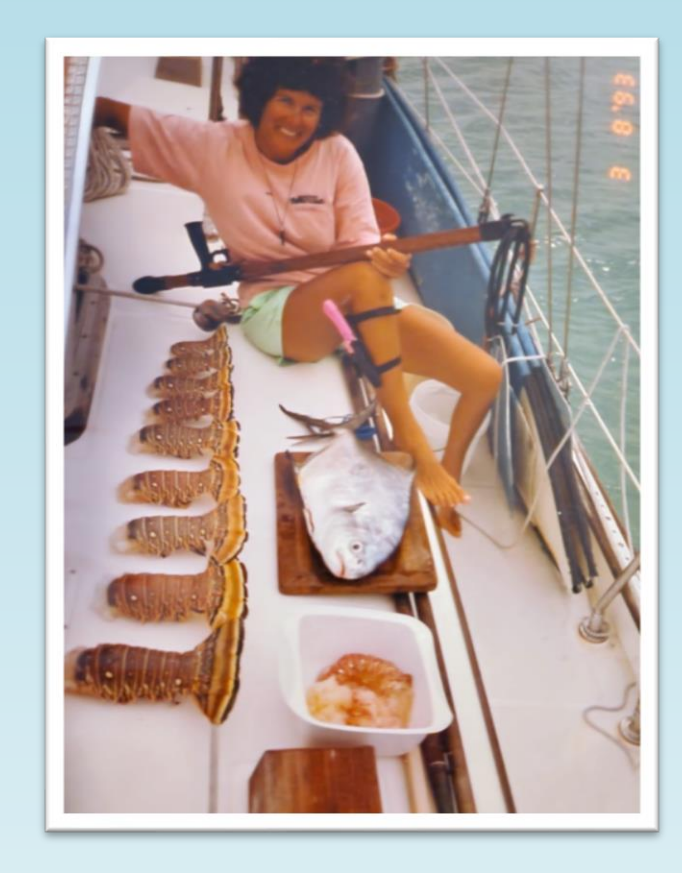
In Cuba with my speargun. Is that lobster I see? (Editors' comment)

I was almost hired as a dive instructor in Grand Cayman. But the local law came in and told the dive shop owner, "You must hire a Caymanian". Oh well!